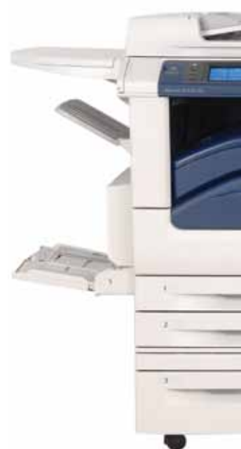
4 Optional integrated stapler finisher