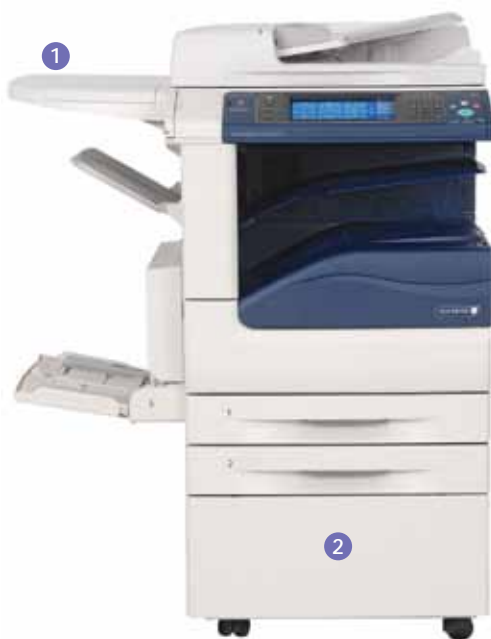
1 Optional Wing Table