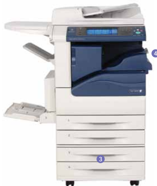
3 Four 500-sheet paper trays adjustable up to A3